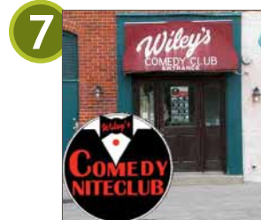
7 Wiley's Comedy Club 101 Pine St. 937.224.5653 wileyscomedyclub.com