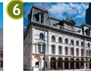
6 Victoria Theatre 138 N. Main St. 937.228.7591 victoriatheatre.com