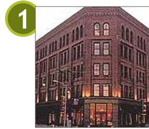
1 The Cannery 424 E. Third St. 937.222.3060 cannerydayton.com