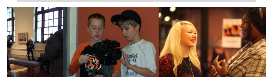
In 2012, FilmDayton headed to the Statehouse to advocate for an increase in the motion picture tax credit that attracts TV and film production to the state. Based on past success, the incentive was doubled and more films will be coming to Ohio in 2013!

FilmDayton Festival Feedback: "Great job, loved the program and the curation of films!!! Bravo!"